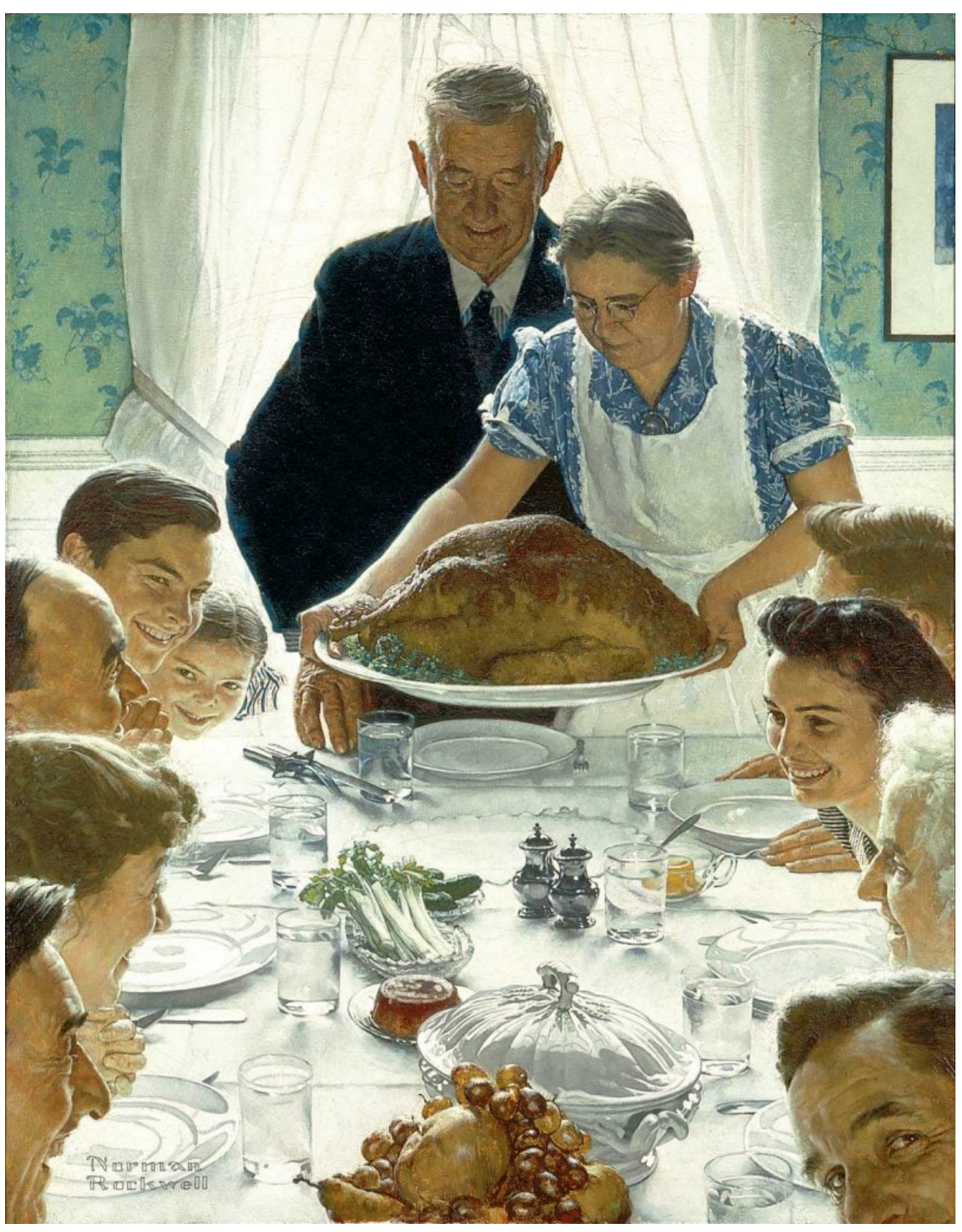
Norman Rockwell: Freedom from Want (March 6, 1943 Saturday Evening Post)